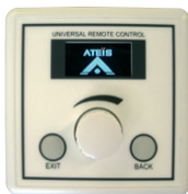
URC Programmable remote controller (RS485).