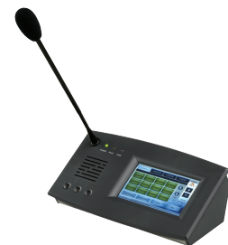
PPM-IT-5 IP touchscreen microphone paging station