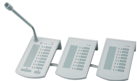
PPM/PPM-8 Serial programmable microphone paging station