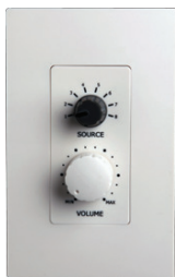
RAC5 / RAC8 5 / 8 Steps remote controller (RS485).