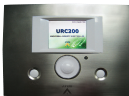
URC200 Programmable remote controller (TCP/IP)